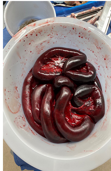
Fig. 2. 320 cm of resected necrotic bowel.

hernia was likely congenital in nature. MALS was likely an incidental finding not contributing to his acute presentation and initially diverted focus.